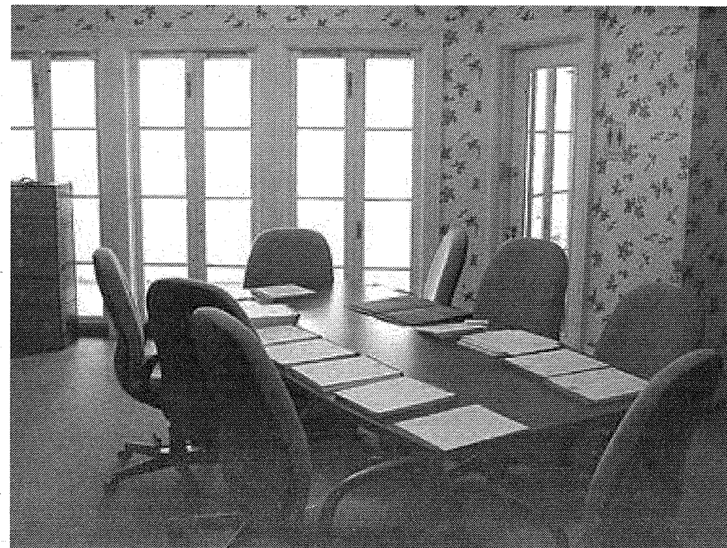
One of Mooreland's conference rooms.

It is recommended to those who have never inquired, to take a look at the Mansion's property from the exterior to the interior. The mansion is located on the East Side of campus and